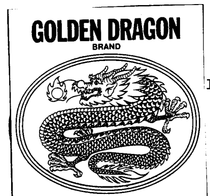
Exhibit SCB-1 to Affidavit of Khoo Chooi Leong 19th September 1979