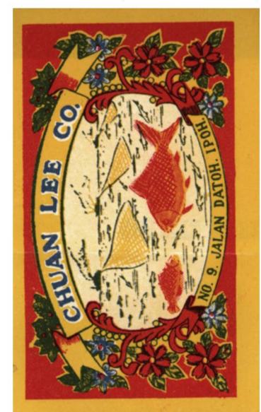
EXHIBIT C.11 TRADE MARK LABEL