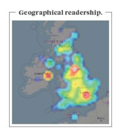
(January to March 2019)

While only covering two issues, I consider it reasonable to conclude that this general geographical spread also applies to all other issues of the magazine.