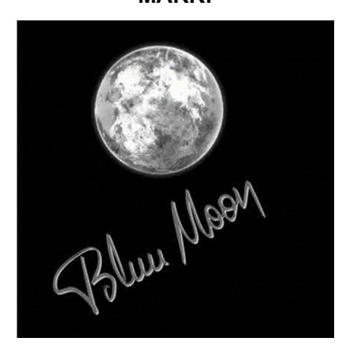
IN CLASSES 30 & 32