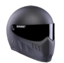
Bandit XXR Motorcycle Helmet M (57/58) Matt Black £25449

Get it Friday, Aug 27 FREE Delivery by Amazon