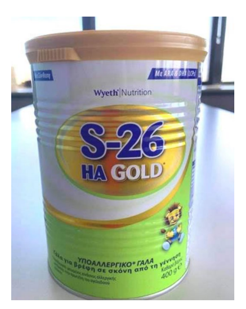
Page 12 of 20