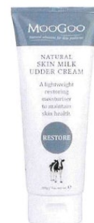
MooGoo Skin Milk Udder Cream 200g (28) £12.50 £6.25/100 g