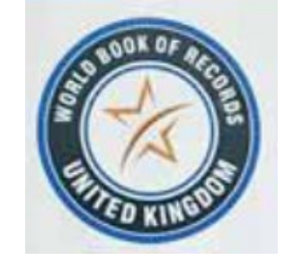
(being the applicant's use)

142. I note the case of Lonsdale (cited above) wherein Norris J found that, under 5(3), look-a-like marks may take unfair advantage. However, the issue I have with these submissions is two-fold. Firstly, the marks shown in the examples provided