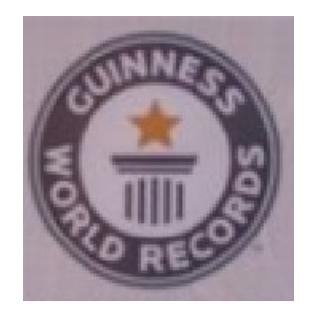
(being the opponent's use)