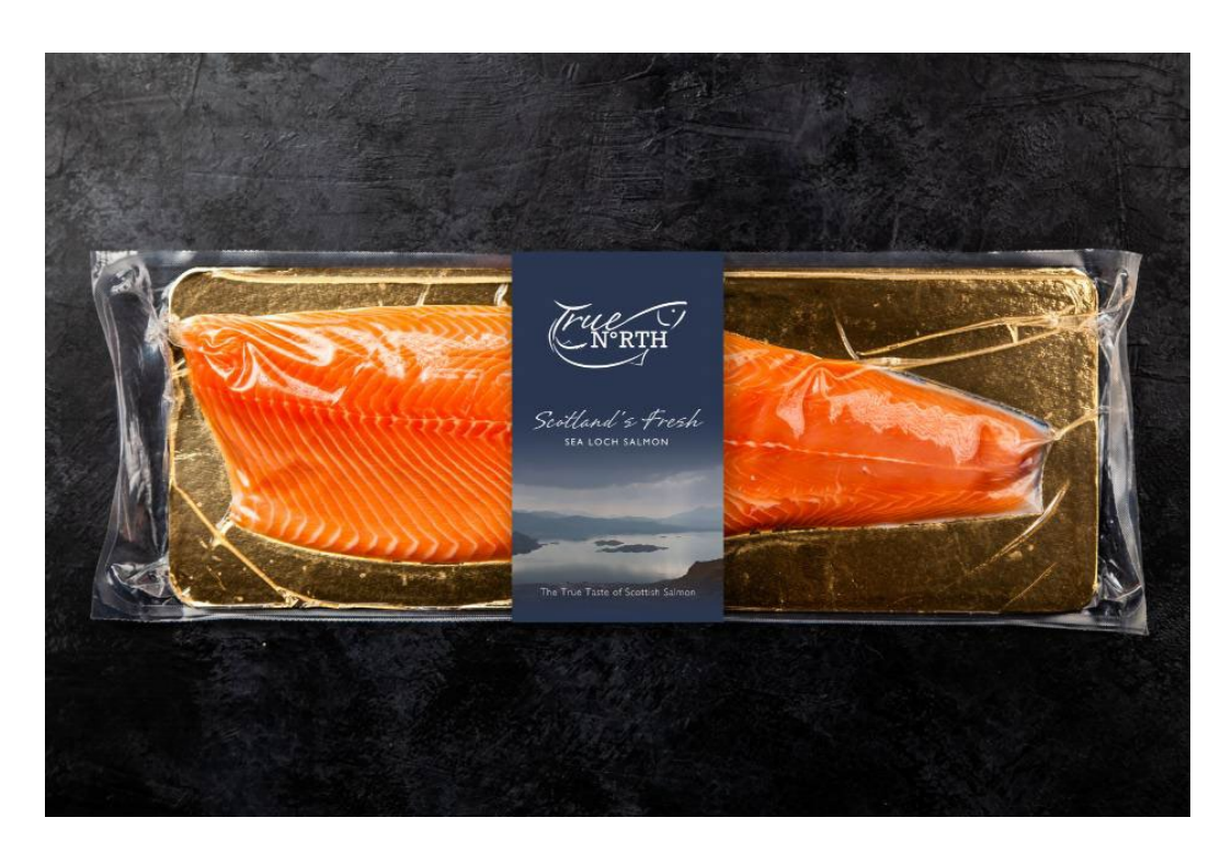
And the following image: