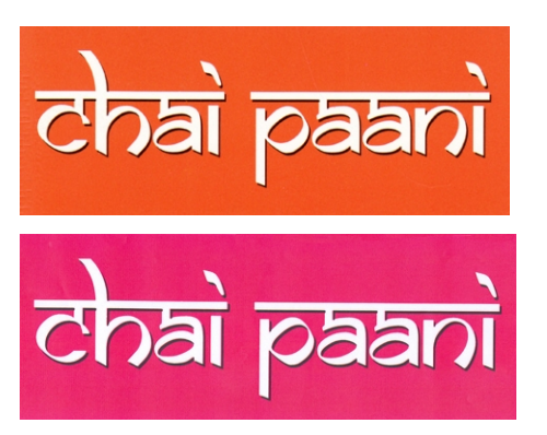
(series of 2) UKTM no. 2636847 Filing date 2 October 2012; registration date 11 January 2013 Relying upon some services for which the trade marks are registered, namely: Class 43 Services for providing food and drink; restaurant, bar and catering services.

2. On 1 October 2020, the application was opposed by Chai Paani Limited ("the opponent") based upon section 5(2)(b) of the Trade Marks Act 1994 ("the Act"). The opponent relies upon the following registration: