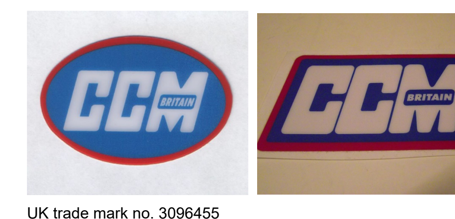
(series of 2) Filing date 26 February 2015; registration date 22 May 2015 ("the Second Contested Registration")