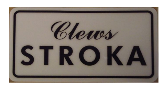
UK trade mark no. 3149895

Filing date 15 February 2016; registration date 20 May 2016