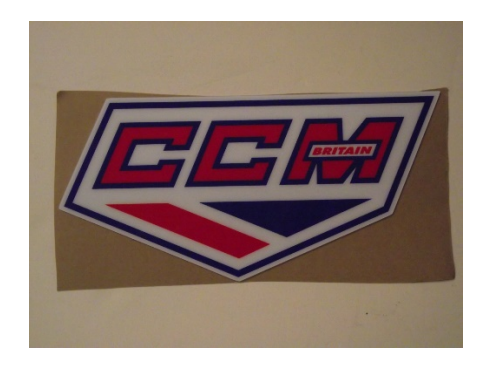
UK trade mark no. 3213698 Filing date 20 February 2017; registration date 12 May 2017 ("the First Contested Registration")

1. CCM Britain Ltd ("the proprietor") is the proprietor of the following trade marks: