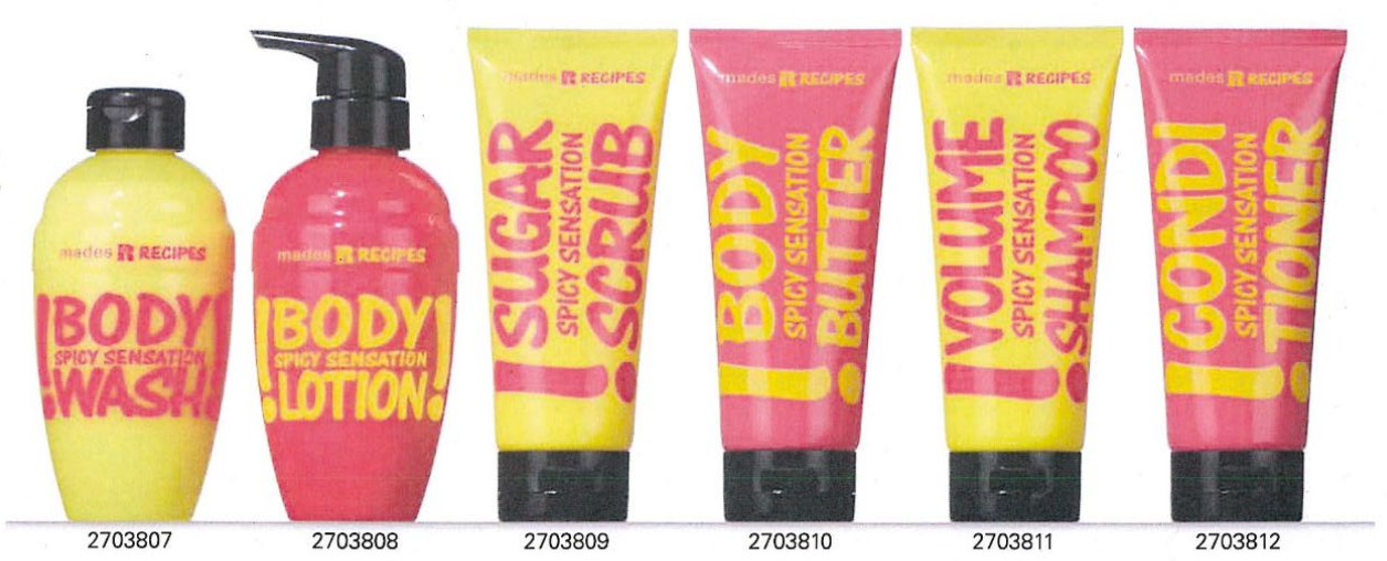
RECIPES SPICY SENSATION with pink pepper extract known to create a re-energised skin