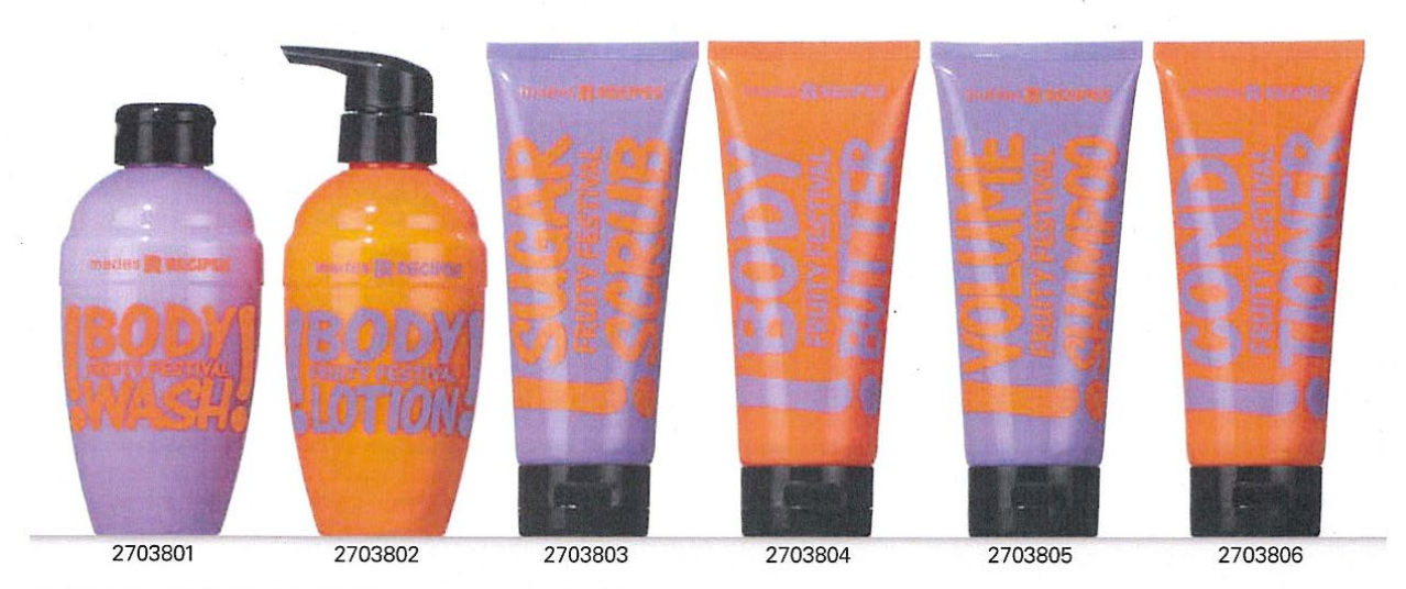
RECIPES FRUITY FESTIVAL with a cocktail of fruit extracts known to create a refreshed skin