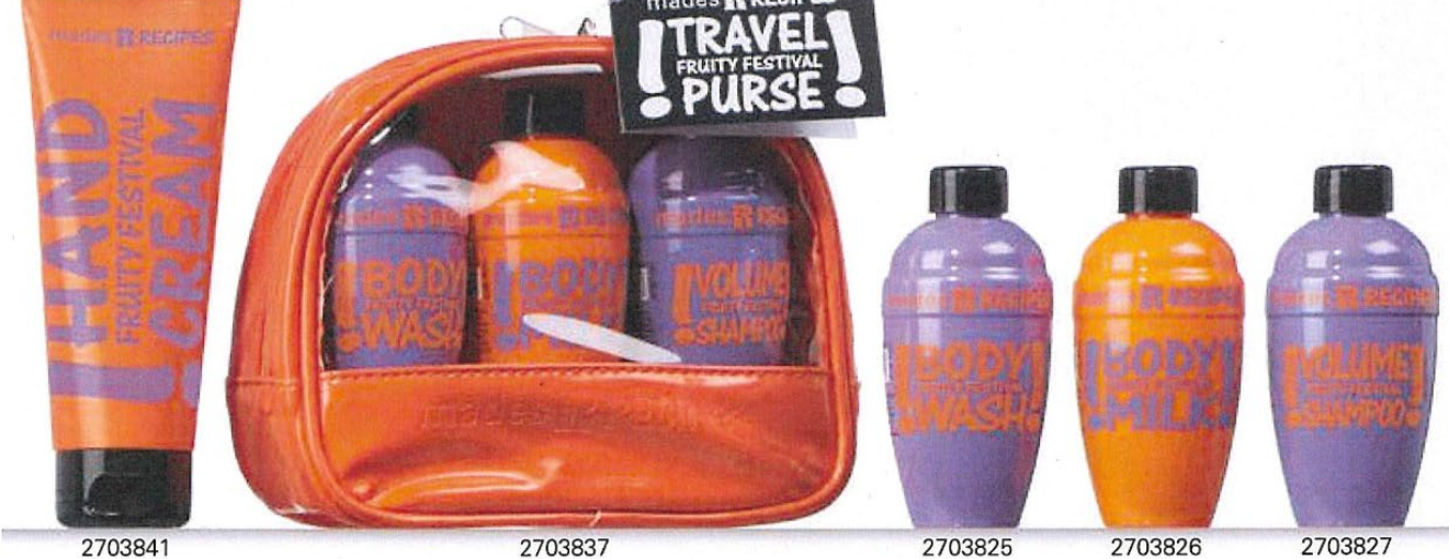
MADES RECIPES FRUITY FESTIVAL travel kit - mini bottles - hand cream