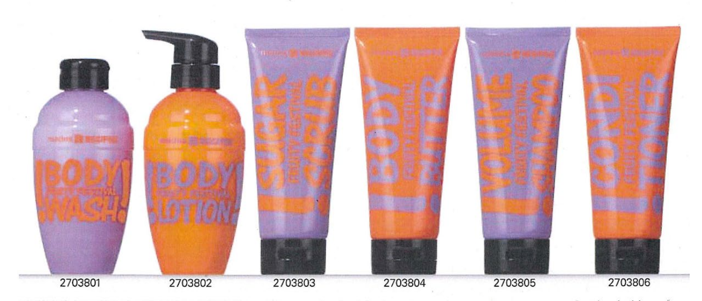
MADES RECIPES FRUITY FESTIVAL with a cocktail of fruit extracts known to create a refreshed skin

14. Exhibit JD3, which consists of a copy of the 2015 product catalogue, is much the same. On page 4 of the exhibit there appears a reference to "mades RECIPES". Page 9 of the exhibit looks like this: