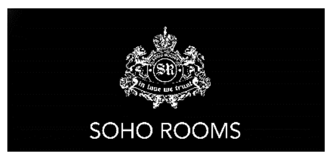
Filing date: 23 February 2018 Publication date: 23 March 2018

Class 35: Advertising; marketing; sales promotions; business information; online ordering services; consultancy, information and advisory services to all the aforesaid services.