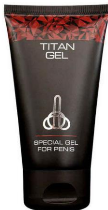
v Titan gel

21. The respective marks are shown below: