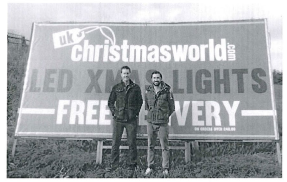
The campaign will run for 7 weeks across various sites promoting the huge range of Christmas lights, trees and decorations on our website <u>www.ukchristmasworld.com</u> and also our newly opened 'Winter Wonderland Outlet' in Barnsley where customers can gain some inspiration for their own display this Christmas.