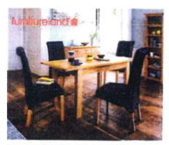
ARLINGTON Extending table and 4 chairs. Was £649 SAVE £100 Sale £549