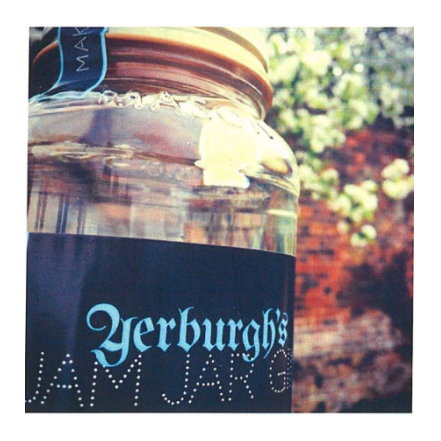
Now even more people can get their hands on Jam Jar Gin!