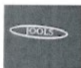
(“the Fourth Sign”)