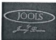
(“the Third Sign”)