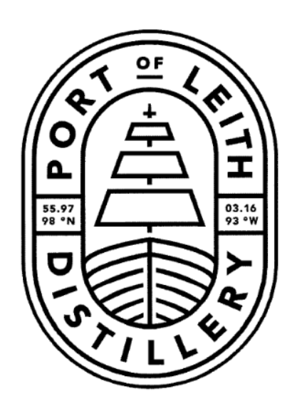
Page 3 of 22