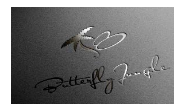
AS A TRADE MARK (SERIES OF 2) IN CLASS 25 AND OPPOSITION THERETO (UNDER NO. 408362) BY TAMASU BUTTERFLY EUROPA GMBH