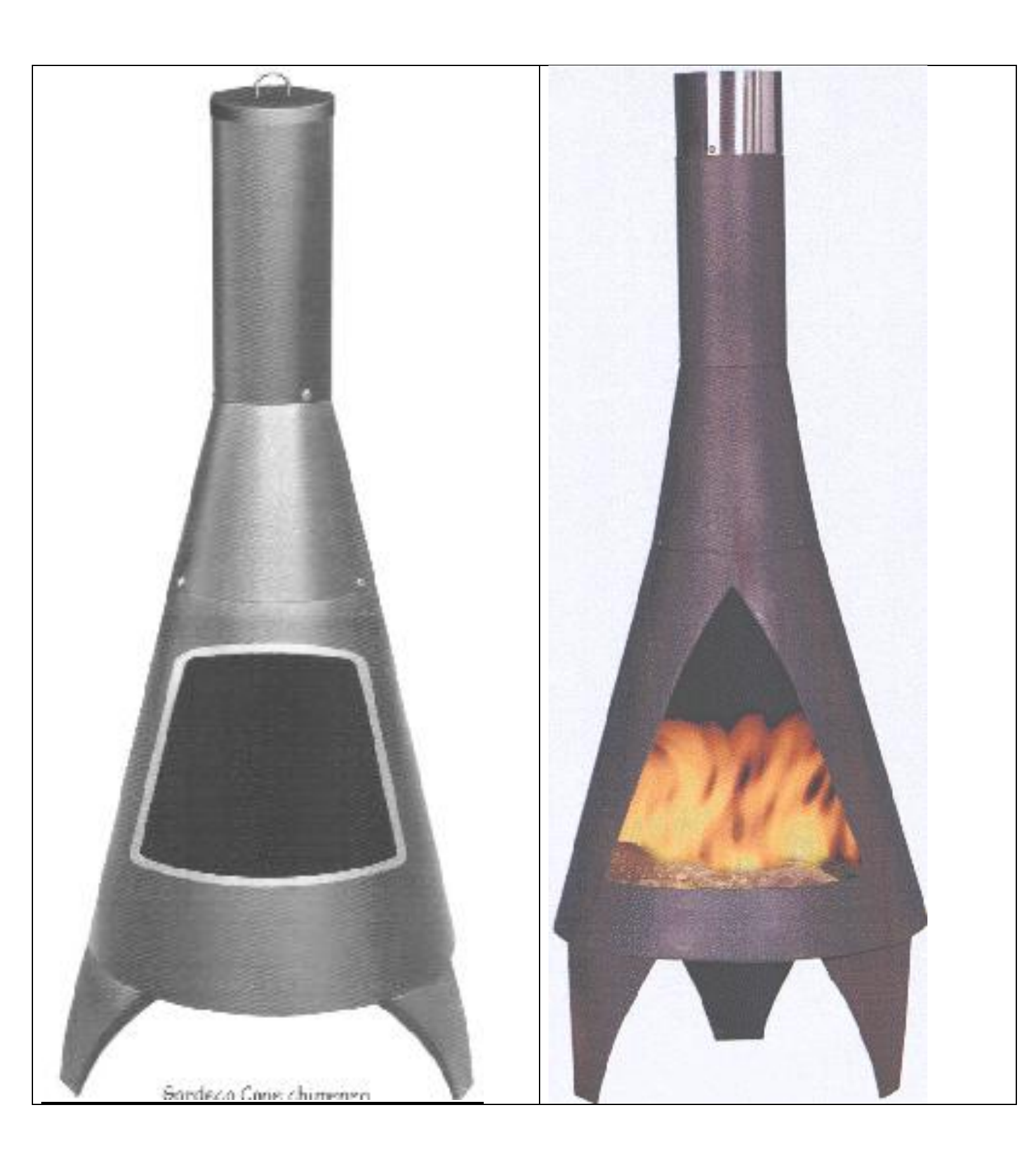
Page 11 of 15