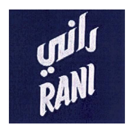
Class 29: Milk and milk products; edible oils and fats.

The earlier mark is not subject to the requirement of proof of use under section 47(2A) of the Act as the registration procedure for the earlier trade mark was completed within (not before) the period of five years ending with the date of the application for the declaration of invalidity.