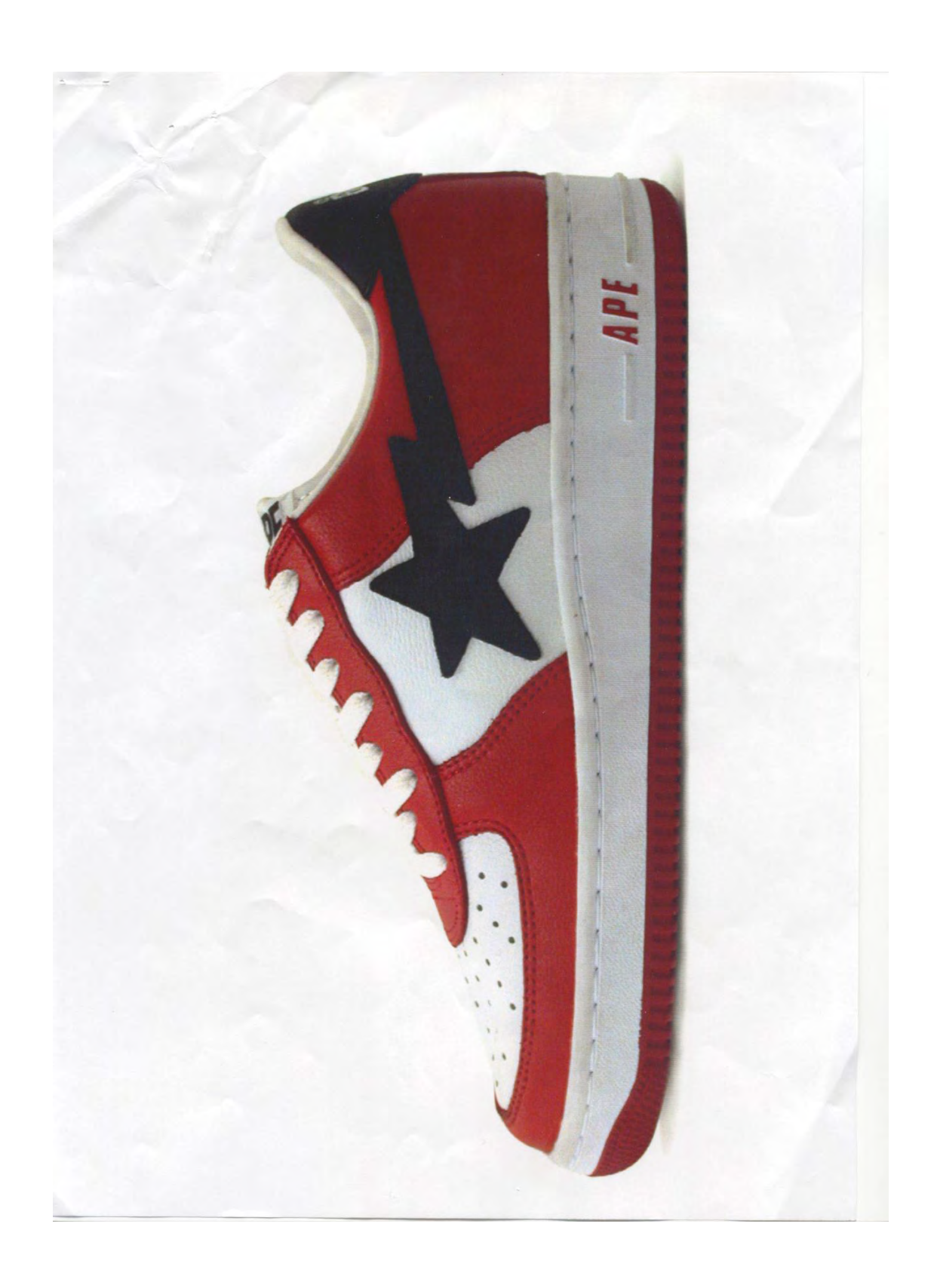
ANNEX 1 This is a copy of Exhibit TF11.