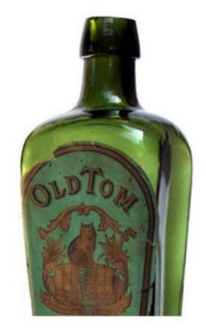
IN CLASSES 33 AND 43