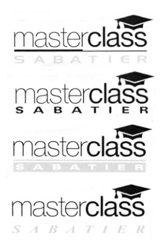
in classes 7, 8, 21 and 25 and the opposition thereto under no 94381 by Rousselon Freres et Cie

In the matter of application no 2408467 by Thomas Plant (Birmingham) Limited to register the trade marks (series of four):