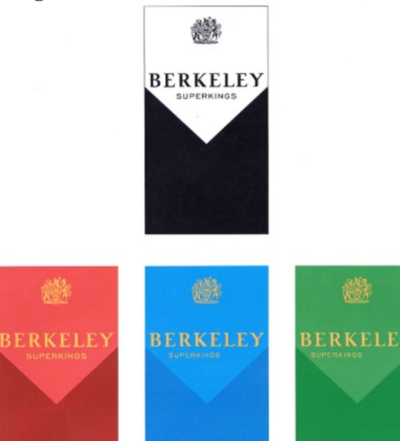
in class 34 and the opposition thereto under no 92905 by Philip Morris Products SA

In the matter of application no 2364231 by Gallaher Limited to register the trade marks (a series of 4):