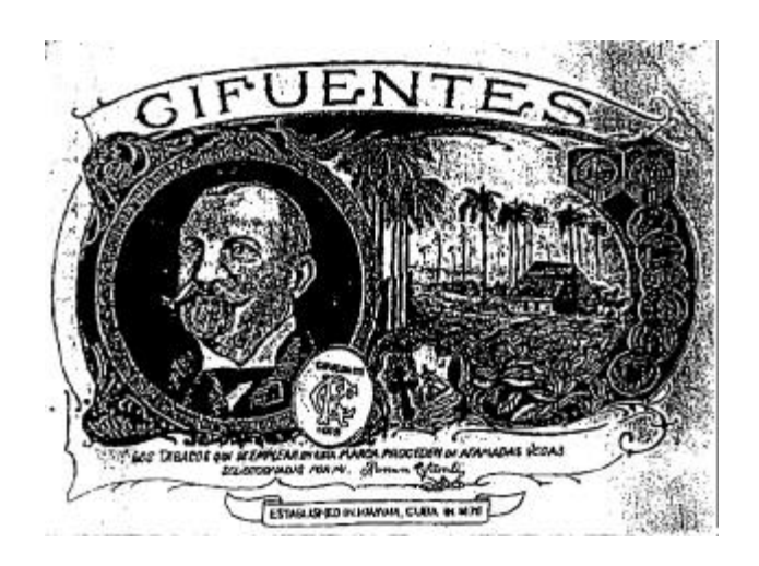
Class 34: Tobacco, cigars, cigarettes; tobacco products; smokers' articles Date of Application: 11 May 1995