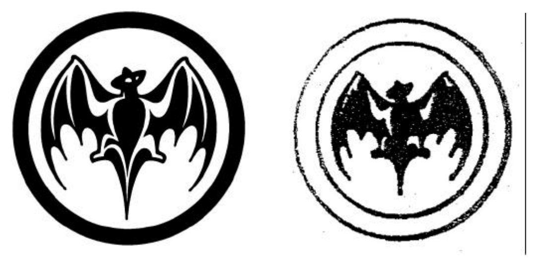
UK Trade Mark No 2252634

33. I now turn to a comparison of the respective goods and trade marks of the parties. It seems to me that the opponent's best case lies with its UK Registration No 2252634 and the Community Trade Mark Registration No 123265 – see Annex One but also reproduced below – for its BAT device solus: