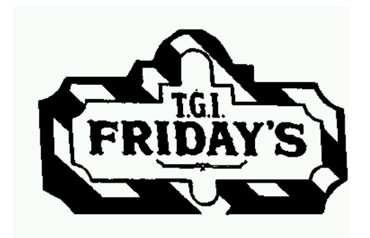
Class 25 Footwear and headgear, all included in Class 25.