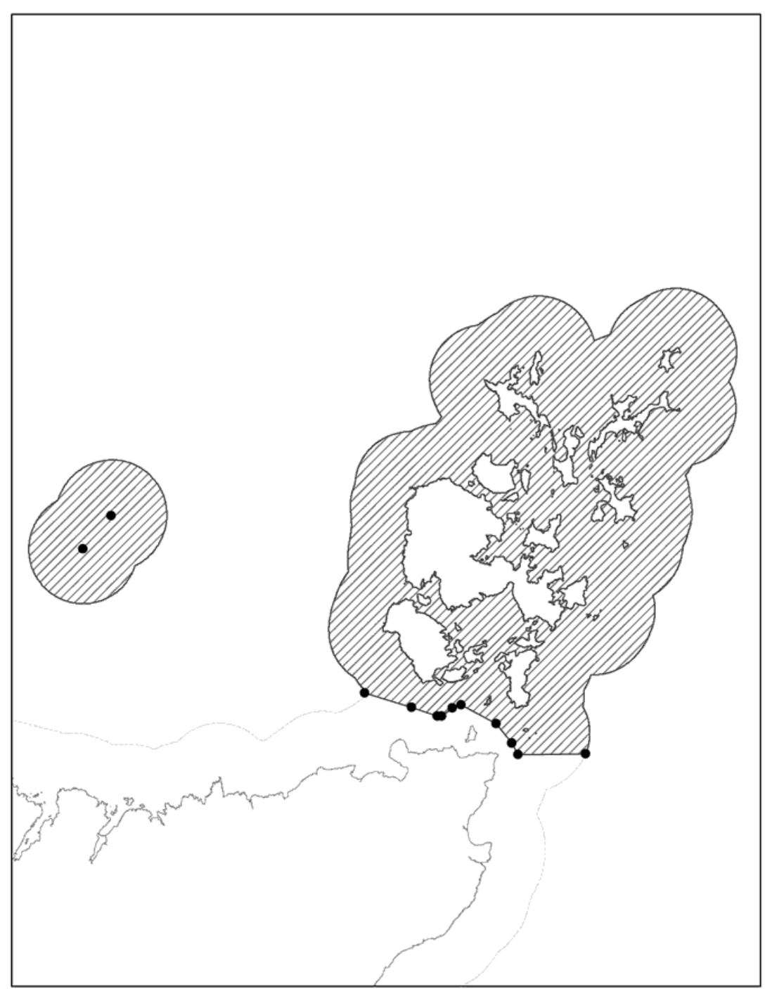
NOT FOR NAVIGATION. Created by Scottish Government (Marine Scottland) 2015, gi0928. © Crown Copyright All rights reserved. Ordnance Survey License No. 100/24555, Danied License Marceters, Datum, WDS 1984, Stendard Parallel, 567:370, DOTA Scola 1:248,710