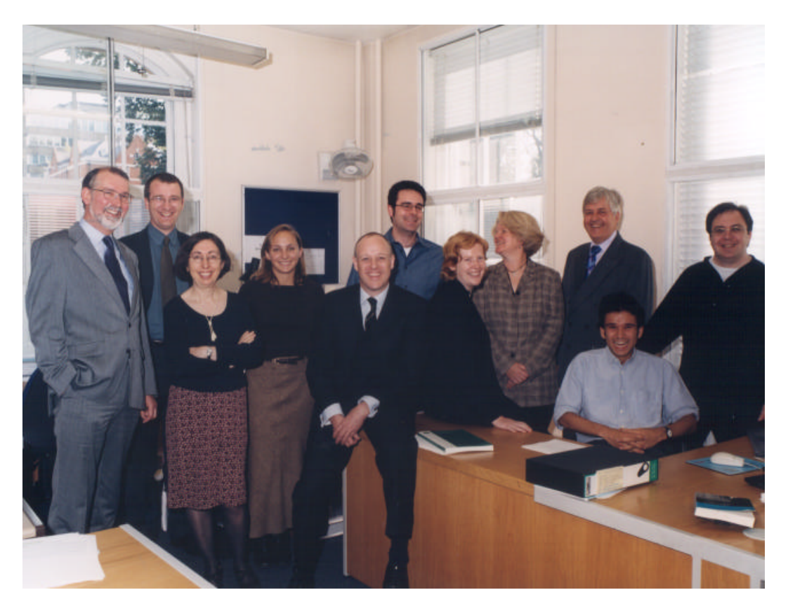
THE HOUSING/ADMINISTRATIVE JUSTICE AND COMPULSORY PURCHASE TEAMS