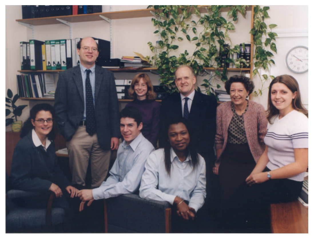
THE PROPERTY AND TRUST LAW TEAM

Committee for their assistance.<sup>6</sup> Work is also continuing on the two further projects, about the Rules of Apportionment and the Rights of Creditors against Trust Funds.