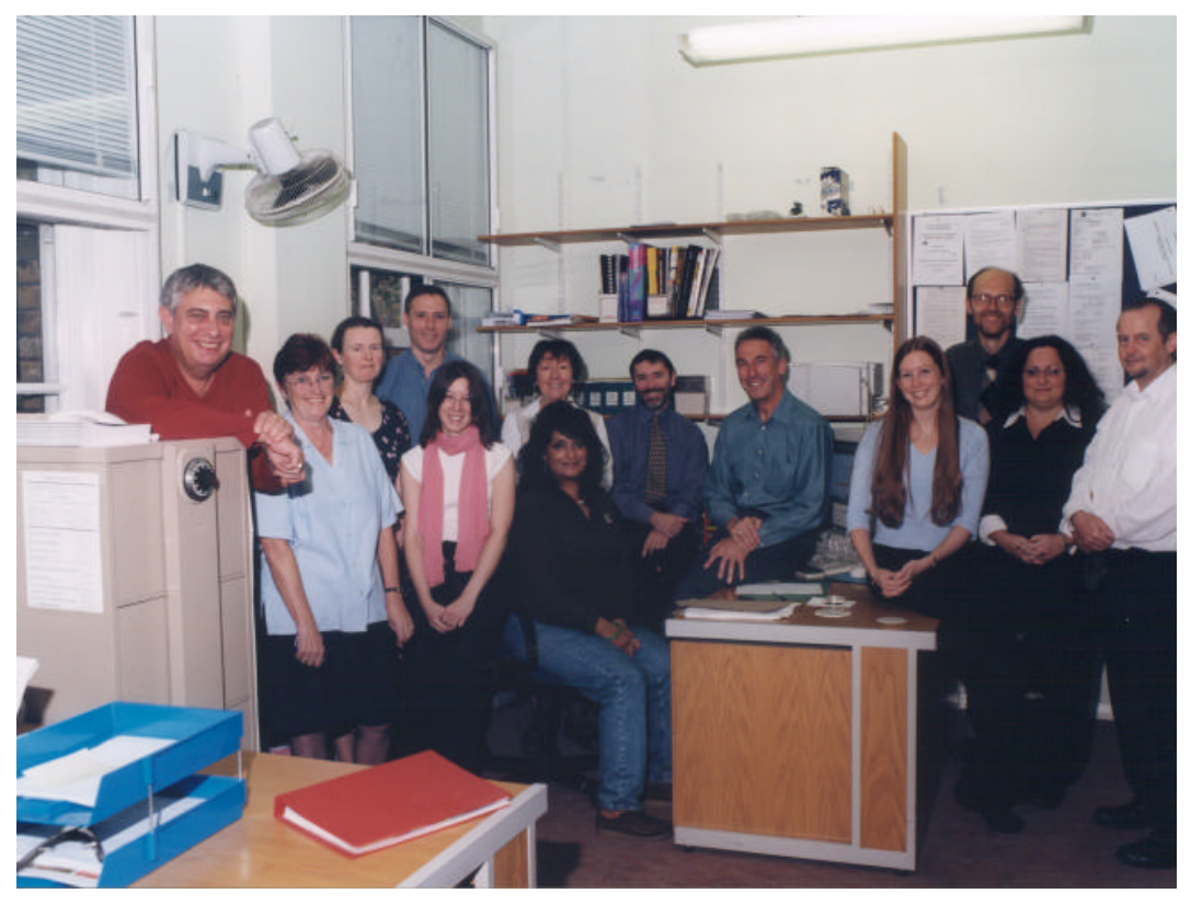
THE CORPORATE SERVICE TEAM