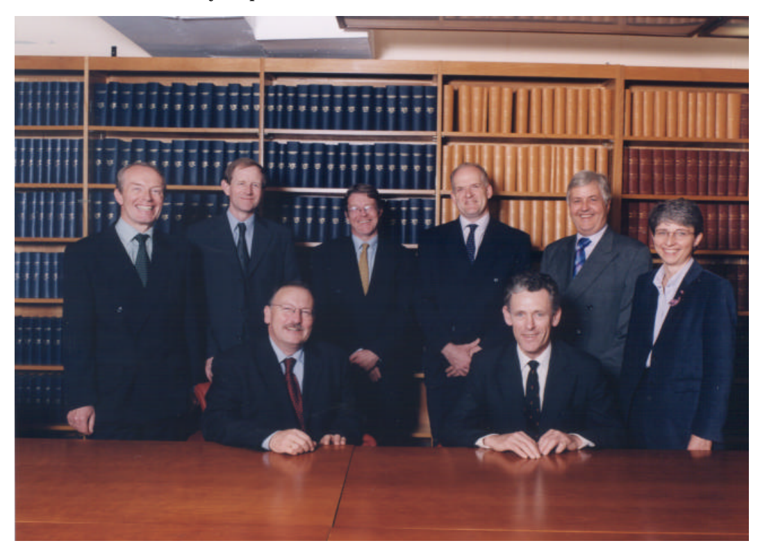
THE LAW COMMISSION WITH THE CHAIRMAN AND SECRETARY OF THE SCOTTISH LAW COMMISSION