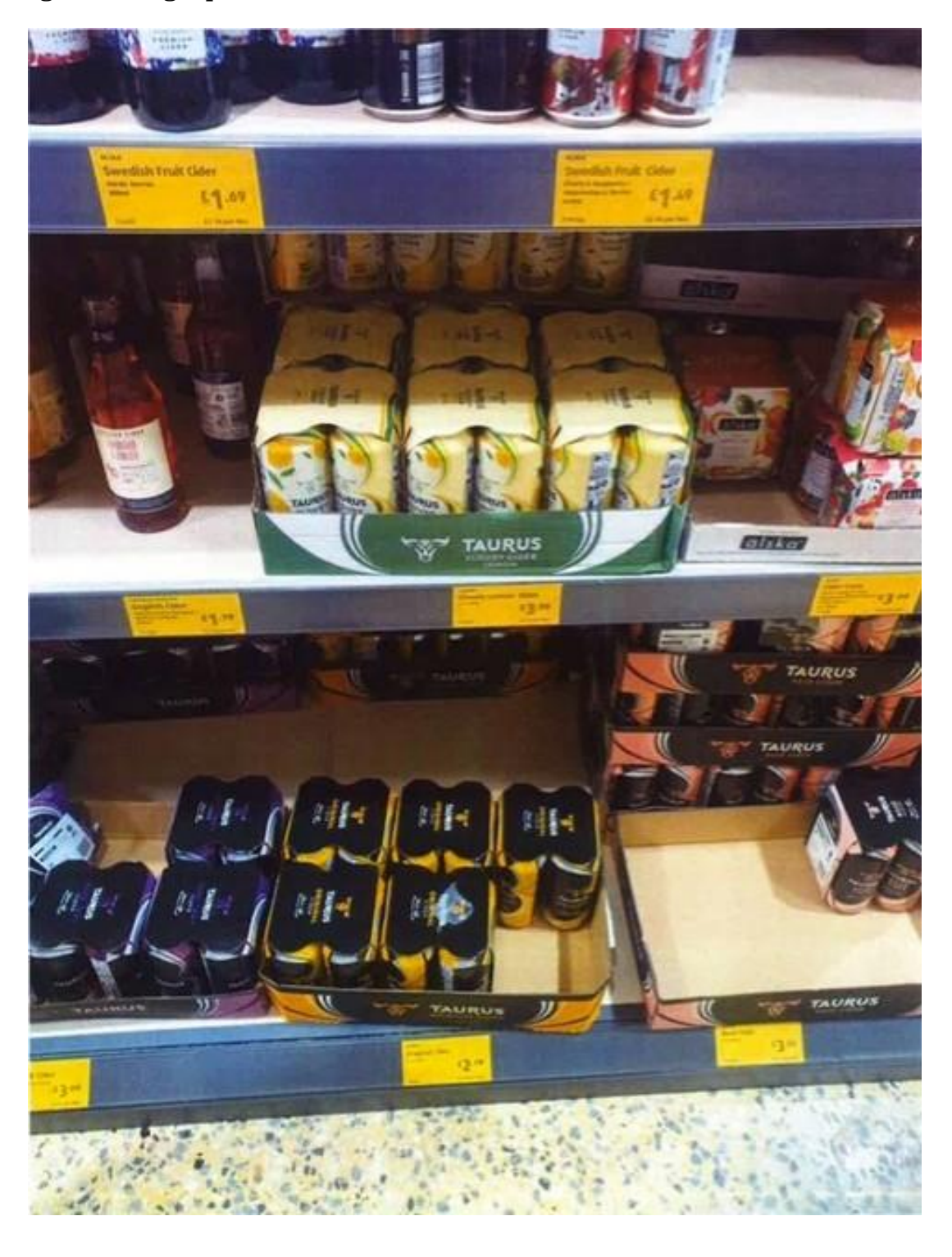
Annex Fig 1: Photograph of Taurus Product on shelf in store