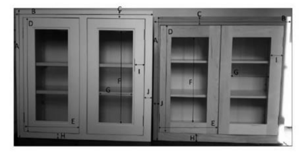
Design 12 - Front View

However, it was accepted during the trial that Design 12 was a modification to an earlier design which had arched, as opposed to straight, tops to the glazing but which was otherwise the same design.