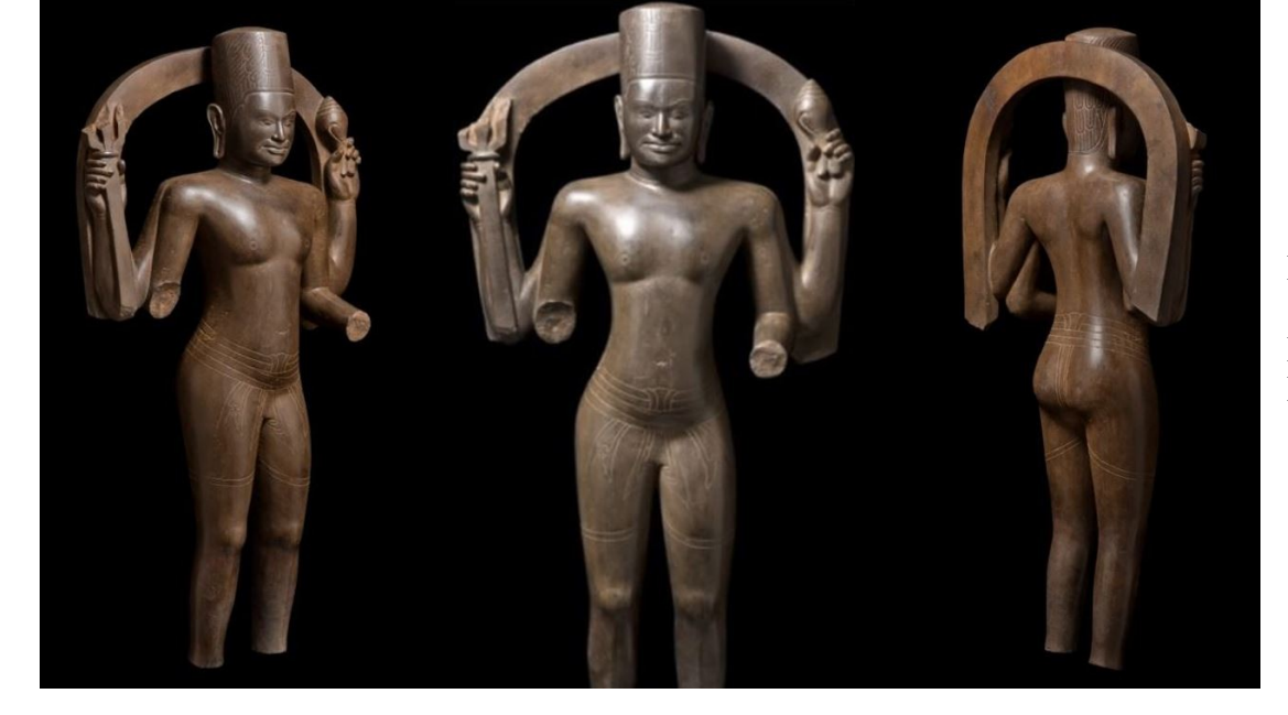
E: The Hari Hara