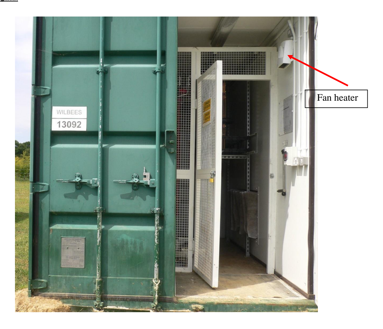
Figure 7: HV switchgear zone showing location of the heater