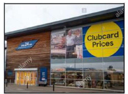
Example of the Sign as used by Tesco, with overlaid text

5. Lidl claim that Tesco's use of the Sign infringes the Trade Marks (and amounts to passing off and copyright infringement). Lidl contend that Tesco are seeking deliberately to ride on the coat tails of Lidl's reputation as a "discounter" supermarket known for the provision of value. Lidl say that Tesco's use of the Sign in connection with Tesco's Clubcard prices is intended to, and does, cause members of the public to call to mind Lidl's business and the Trade Marks, including being suggestive that the prices of goods offered by Tesco for sale under or in connection with the Sign are offered at the same prices, or lower prices, than could be obtained for the same or equivalent goods in Lidl stores. It will be appreciated that Lidl's case that the Wordless Mark has been infringed is, if the registrations are valid, potentially easier for Lidl to sustain than their case that the Mark with Text has been infringed because of the absence from the former of the word LIDL. Tesco deny these claims and counterclaim for (among other things) a declaration of invalidity of the registrations for the Wordless Mark, alternatively revocation on the ground of five years' non-use.