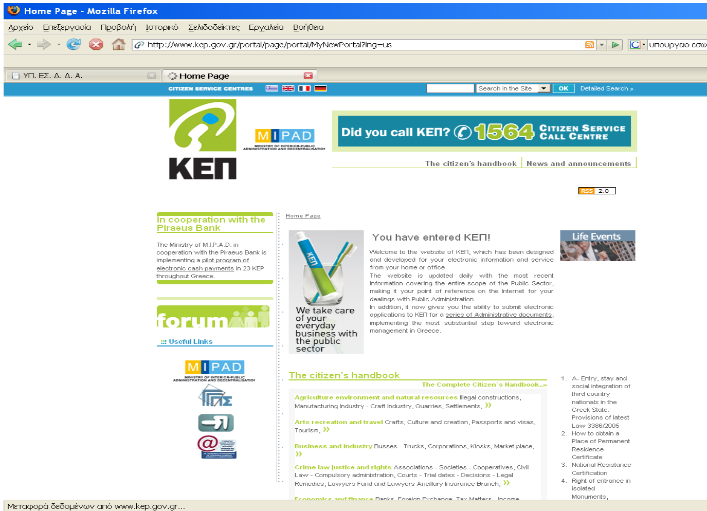
Figure 2: The Citizens' Centre Portal