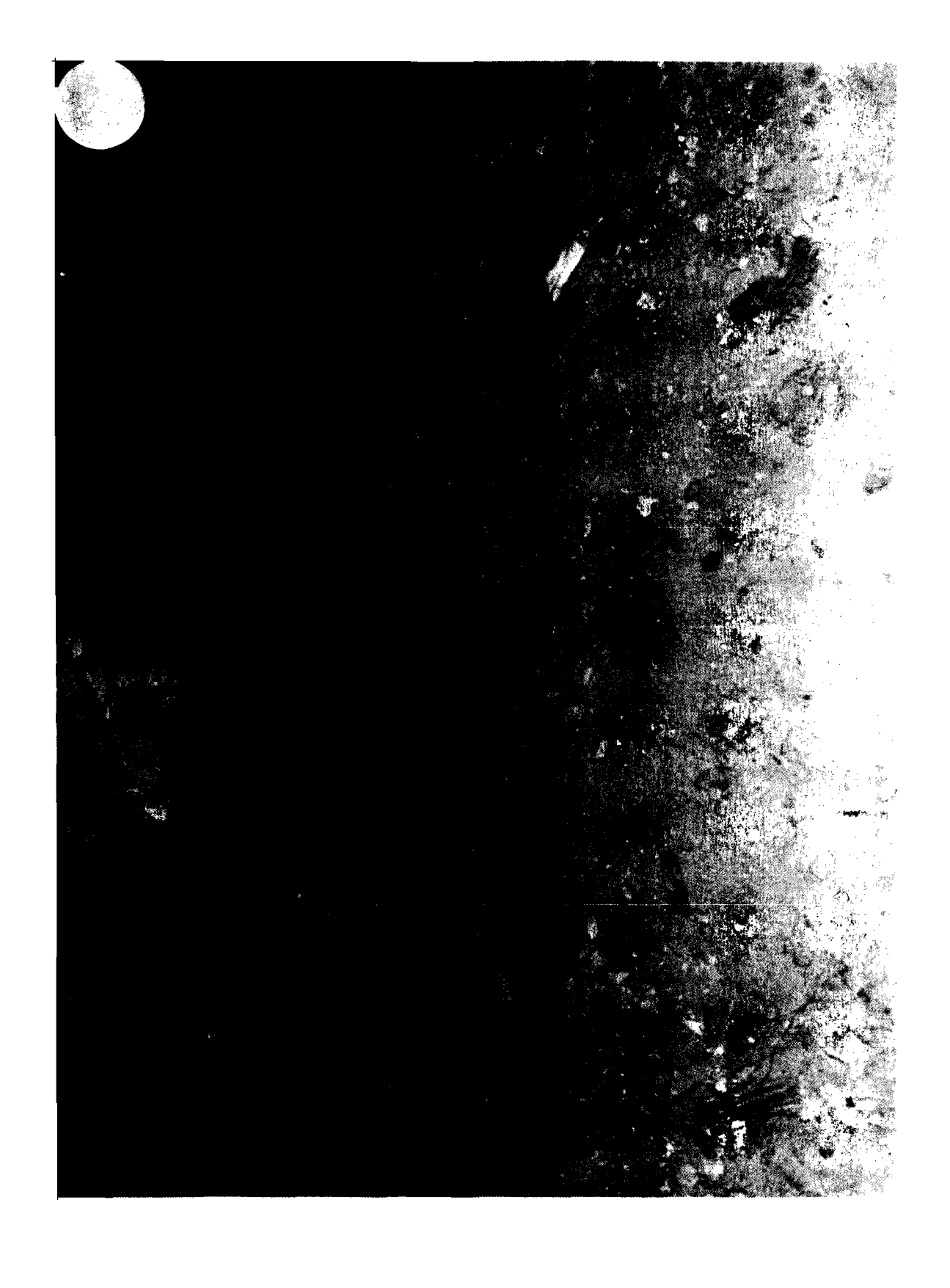
Exhibits Prosecution Exhibit P.6 Photograph