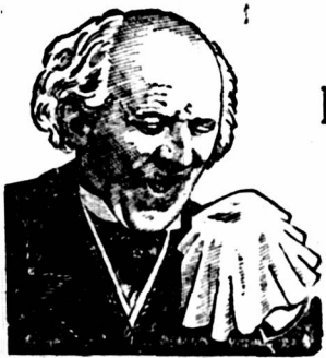
EXHIBIT P8 S. 1679/58 Date 30/5/60