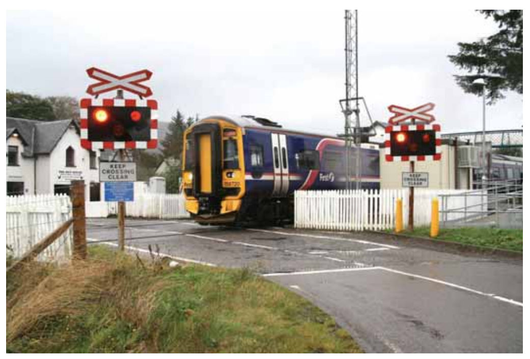
The automatic open (ungated) locally monitored level crossing (AOCL) at Strathcarron station on the Inverness to Kyle of Lochalsh line: note the flashing lights.