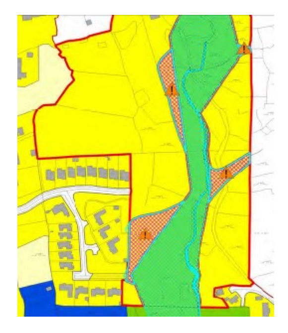
Figure 5 Extract from the Bearna Plan Village Centre Zoning Map