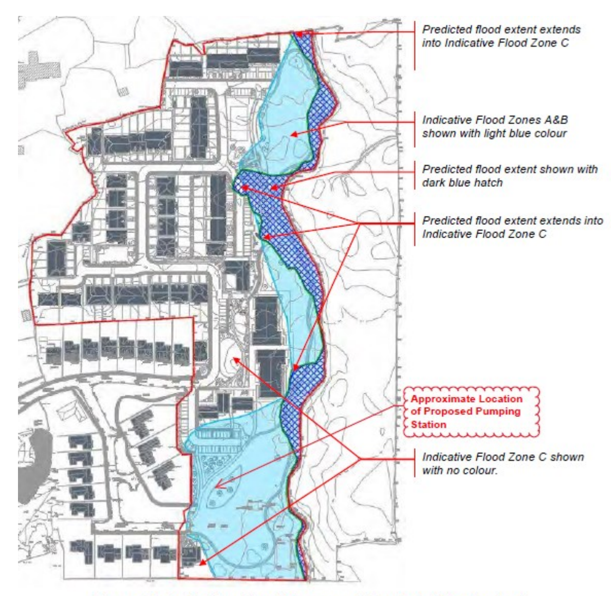
Figure 7: Indicative Flood Zones and Predicted flood extent