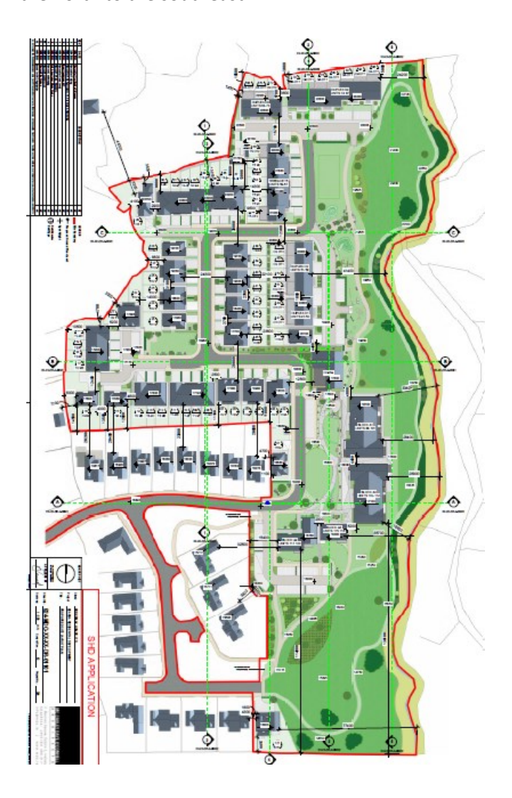
Figure 2<sup>9</sup> Extract from Planning Application Proposed Site Layout Plan<sup>10</sup>.