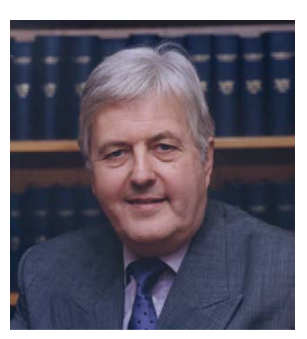
TEAM MEMBERS <sup>1</sup>