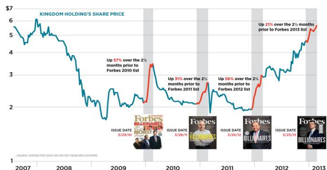
Click to enlarge. Shares of Prince Alwaleed’s Kingdom Holding show a recurring pattern of sharp jumps right before the Forbes Billionaires List.

Of course, that media buzz is only “fun” if the stock is performing well. The prince, ever image-conscious, had no doubt it would. “I am very pleased that the IPO continues to go strongly,” he told the Arab News the day the shares were offered. “This indicates that Saudis are recognizing the potential of the No. 1 company in the Kingdom.” No matter that oil behemoth Saudi Aramco has pumped the economy full of cash and supported legions of royal family members for decades. “His vision is to be the top-tier wealthiest recognized