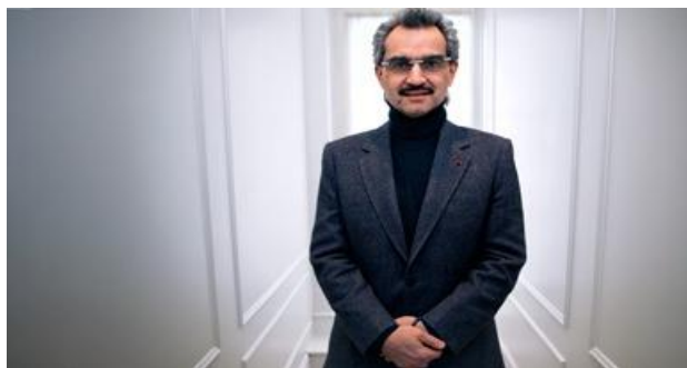
Prince Alwaleed

Any reporter who shows an interest in Prince Alwaleed Bin Talal of Saudi Arabia can expect at some point to get a little gift from His Royal Highness. A driver will courier over a thick, tall green leather satchel, embossed with the oasis palm logo and name of Alwaleed's Kingdom Holding Kingdom Holding Co. , weighing