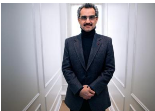
Prince Alwaleed