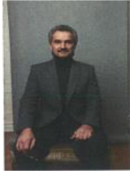
In Pictures: Prince Alwaleed bin Talal

The daily surroundings are absurdly opulent. His main palace in Riyadh has 420 rooms, filled with marble, swimming pools and portraits of himself. If he needs to go on a business trip, he has his own 747, a la Air Force One, except unlike the President, his plane has a throne. If Alwaleed wants a change of pace, he can go to his 120-acre “farm and resort” at the edge of Riyadh, complete with five artificial lakes, a small zoo, a mini-Grand Canyon, 5 homes and several outdoor spots designed for his entourage to take dinner together.