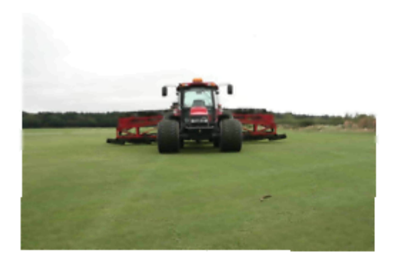
Appendix 2 Pictures referred to in the Particulars of Claim (slightly cropped)