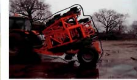
The MaxiMow 13 does not have an equivalent position due to a different folding sequence.