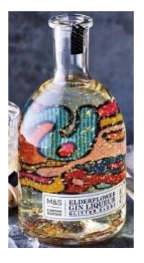
2019 Snow Globe