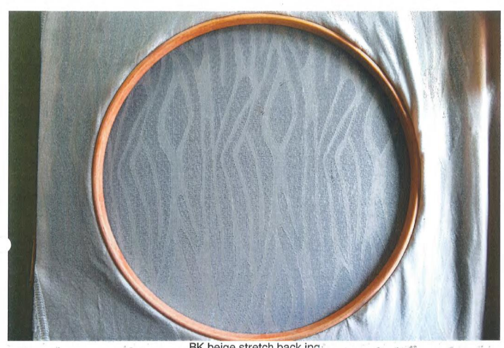
BK beige stretch back.jpg