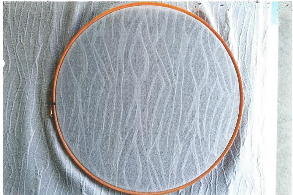
BK FR BEIGE STRETCHED.jpg