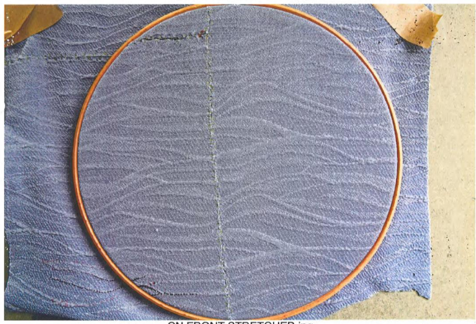
CN FRONT STRETCHED.jpg