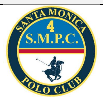
Pic 6 Cad book 2008 CAD dated 7 Jan 2008 [A8/2477]