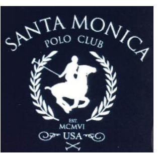
Pic 66 A/W Cad book 2014 [A9/2732]